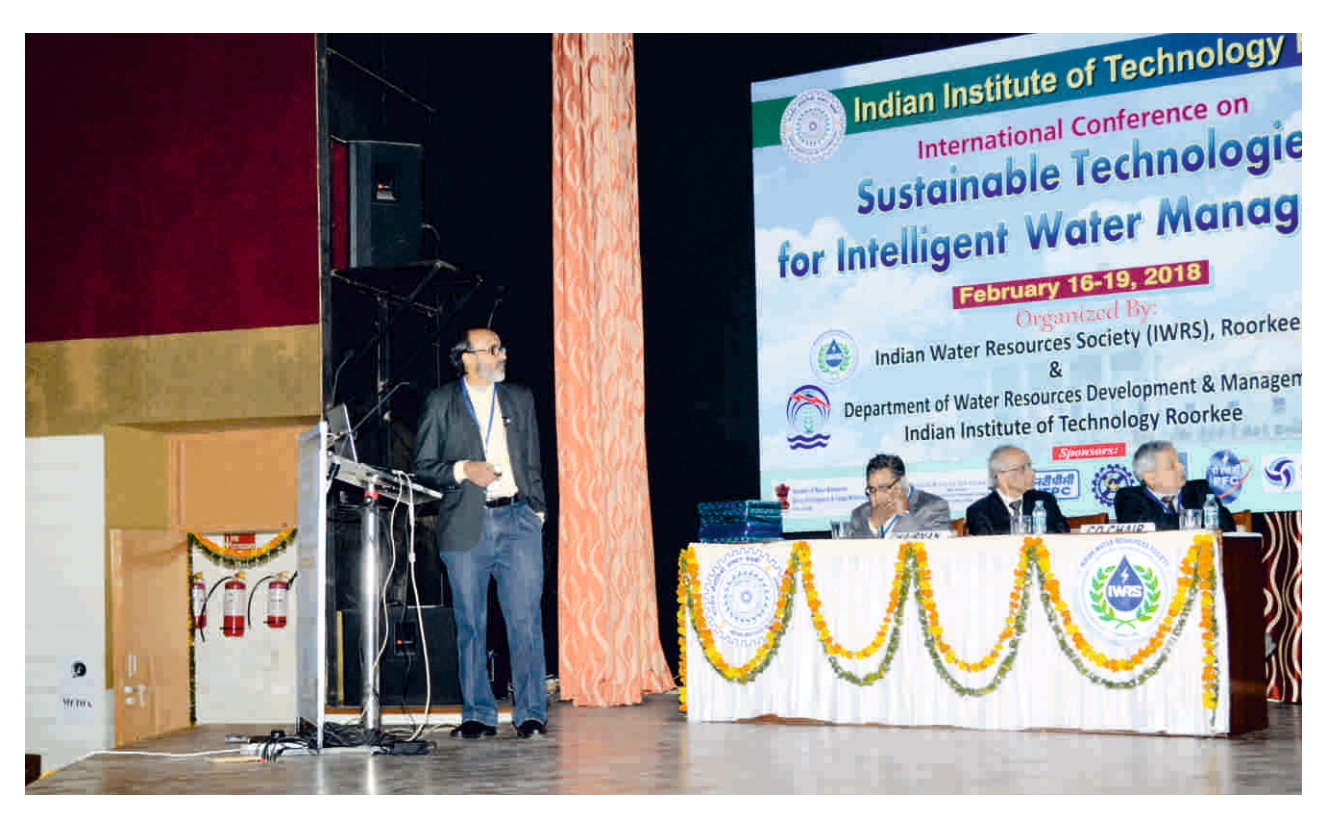
Plate 11: Presentation of Keynote paper by Prof. T.I. Eldho, IIT Bombay during a plenary session.