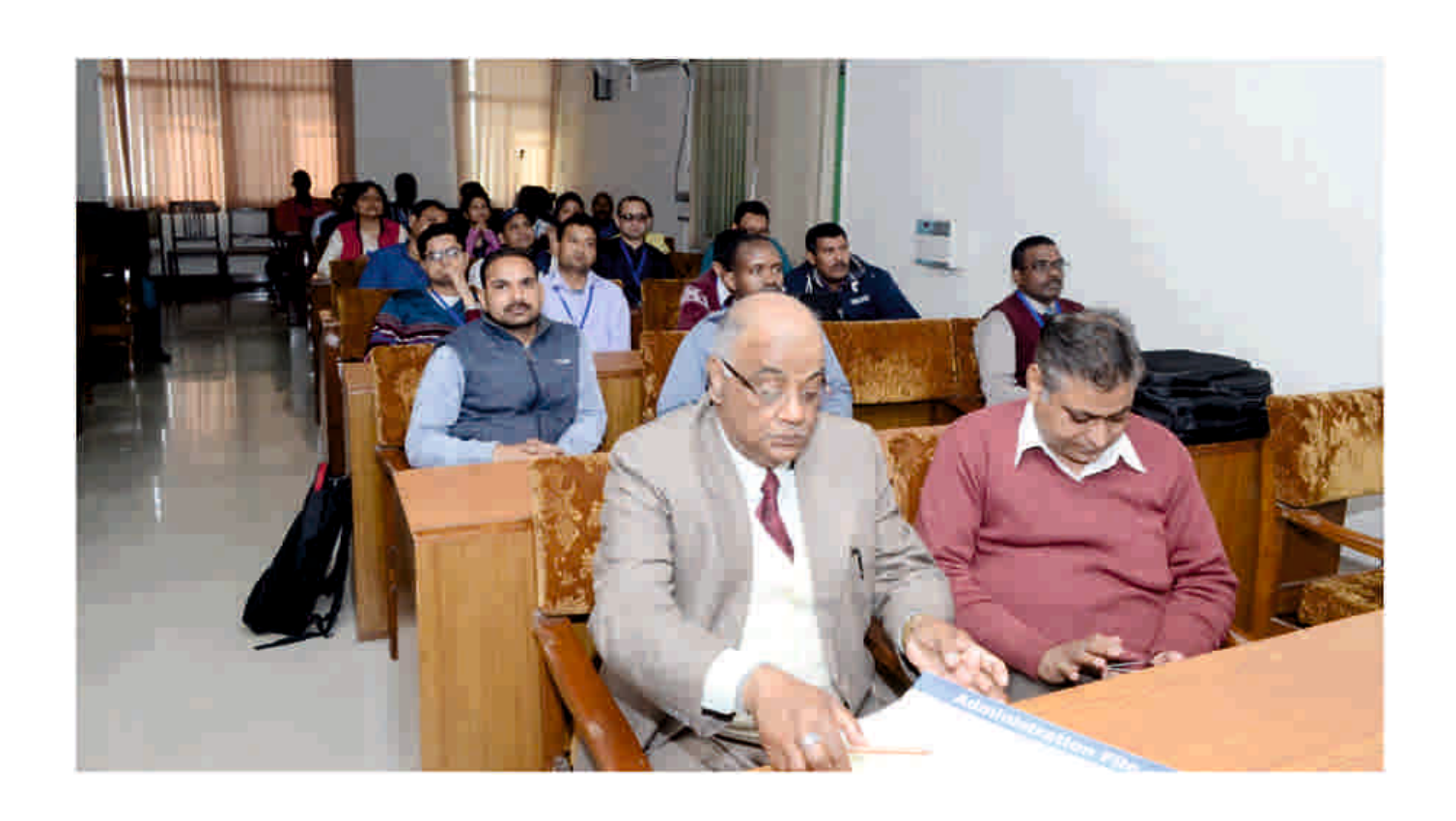
Plate 23: Evaluating Committee and students attending the PICO presentation during the conference