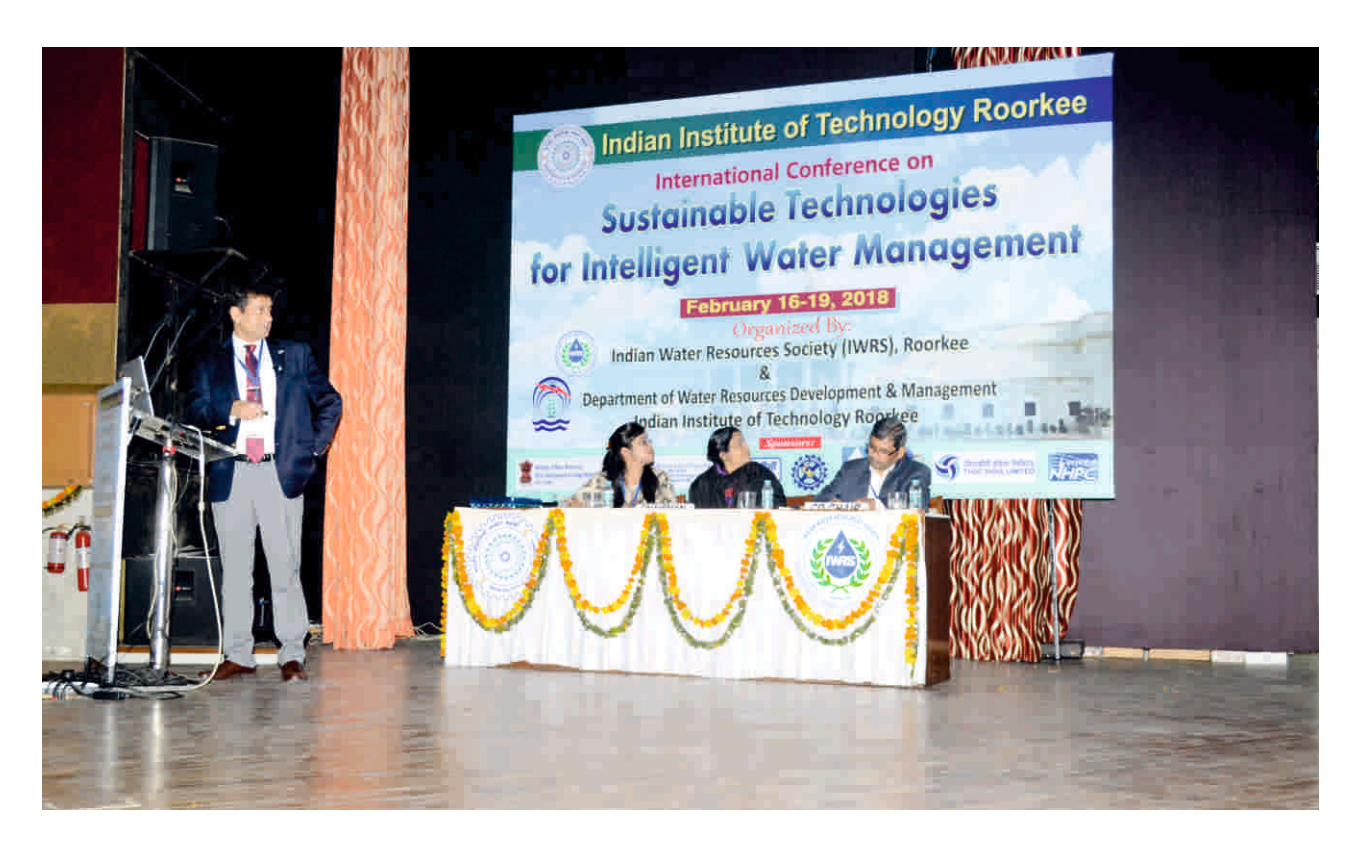
Plate 12: Presentation of Keynote paper by Prof. Indraject Chaube, Purdue University, USA during a plenary session.