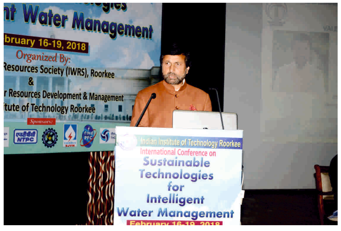
Plate 20: Address by Chief Guest during valedictory function.