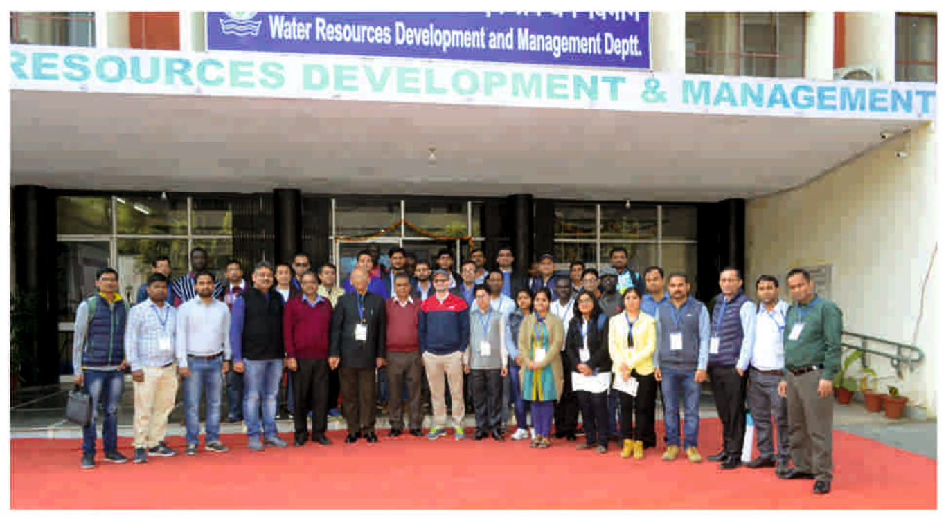
Plate 25: A group photograph of some of the delegates attended the International conference.