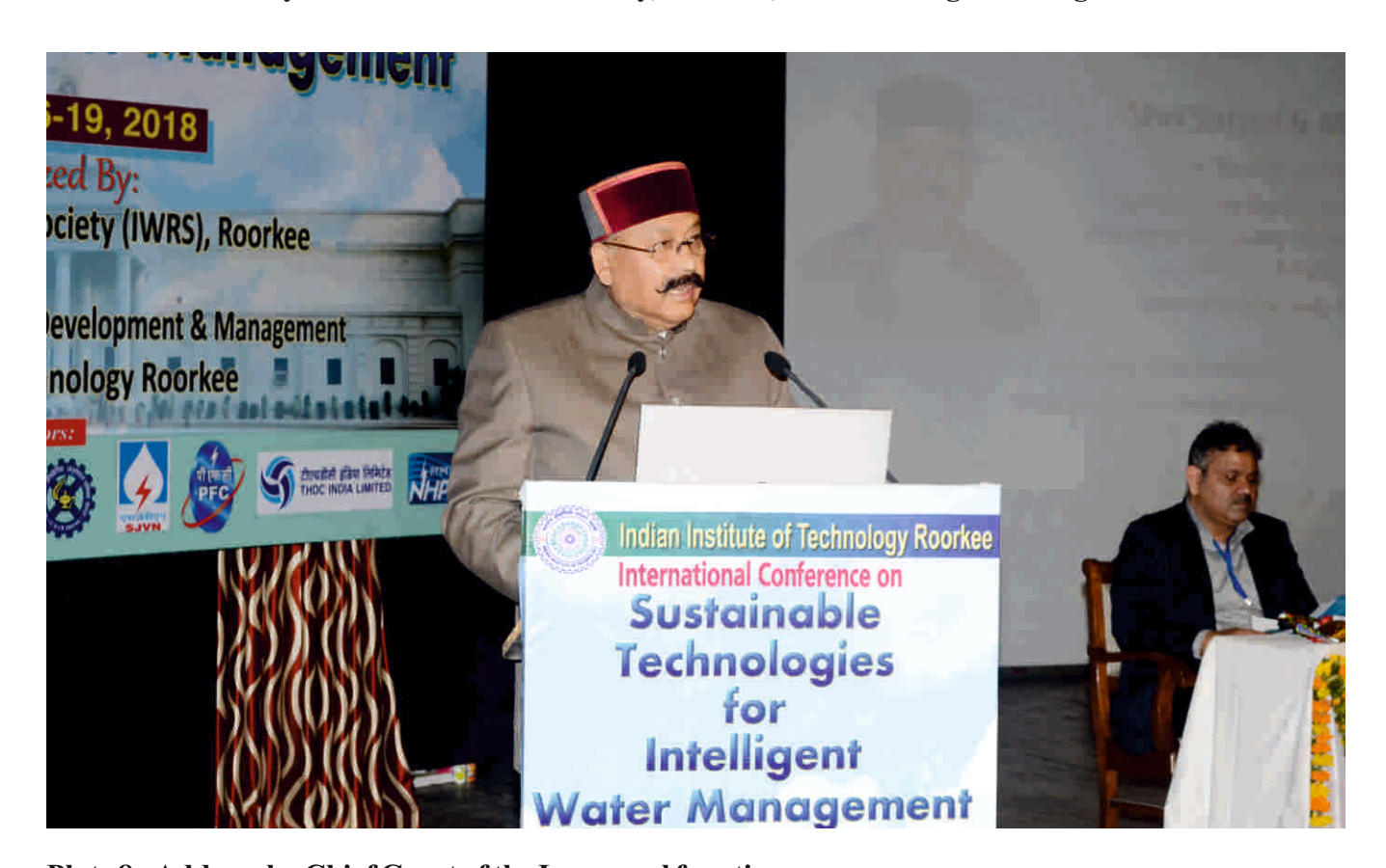
Plate 8: Address by Chief Guest of the Inaugural function