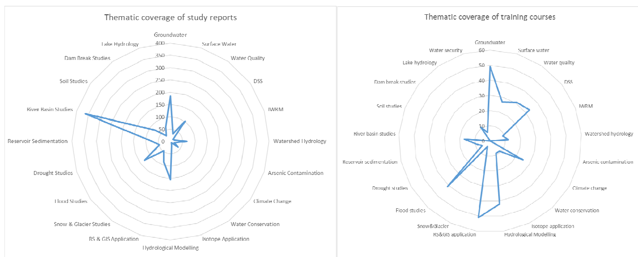
Fig. 2: Theme-wise coverage of study reports and training courses during 1991-2020